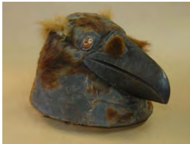
The Tlingit Battle Helmet worn in the Battle of Sitka

In the aftermath of the 1802 catastrophe, Baranov himself returned to lead the counter attack on the Tlingit fort and was wounded in the battle. A Tlingit woman, married earlier to a Russian at Old Sitka served as an interpreter for her people, but badly misunderstood the meaning of the truce flag that Baranov raised after the battle, seeking to negotiate