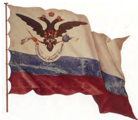
The Russian American Company Flag

The Russian battery on shore would fire a volley, and the American naval vessel in the harbor would answer, each echoing the salute of the other. The flag poles were local spruce, over 50 feet high. As the American flag was being raised, the Russian flag got caught and wrapped around the pole. As the attendant tried to free it, the flag began to tear. There was no way to halt the cannonade so some sailors tried to shimmy up the pole to untangle it, but about half way up, they ran out of energy and froze there. Finally a Tlingit rigged a boatswain's chair, a rope devise, and was hauled up to the Russian flag. The strong winds had whipped it around the pole and it was stuck fast.