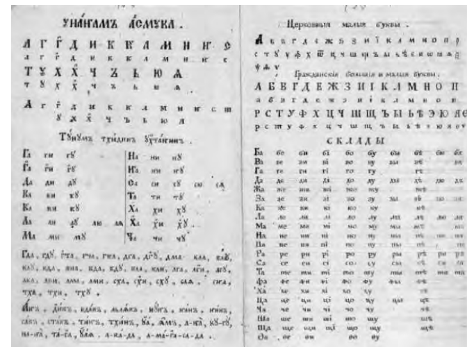
A Russian Primer penned by Fr. Jacob Netsvetov

On the far end of Lincoln Street, behind the Pioneer (retirement) home, there stands a replica of one of the several Russian blockhouses that once defended Sitka from attack. There, in the 1830s and 1840s, stood a chapel in which the Tlingits who had been baptized worshipped in their own language, led by priests of both Russian and Alaska Native backgrounds. The most famous of these was Father Jacob Netsvetov.