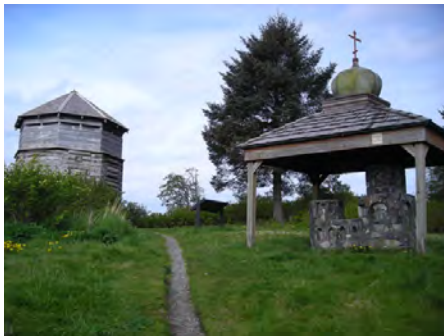
Replica Blockhouse near the Memorial to St. Jacob Netsvetov on the site of the Tlingit chapel.

As his health began to fail, Netsvetov at last retired to Sitka, where he served the Tlingit chapel. He located his wife's grave and erected a memorial stone plaque over it, but when he himself died, and was buried "by the doors of the chapel" no such permanent marker was erected. We do not know exactly where within the cemetery this remarkable saintly Aleut is buried, but there is now a memorial to him on the grounds, so that he would not be forgotten. His wife's grave lies further up Marine Street, marked by a white Russian-style three-barred cross with the stone inscription still over it.